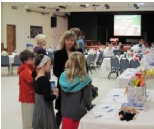
Attendees view the silent auction items