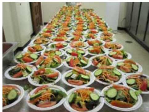
Salads prepared by the Youth for the auction attendees