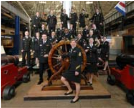
U.S. Navy Band Sea Chanters