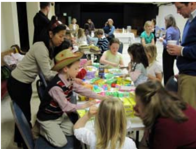
The Palm Sunday crowd gets to work on their projects.

We had a sweet time last Palm Sunday in the Vestry constructing Easter Peeps wreaths and bonnets and bowlers for Easter Sunday. Using peeps, paper plates, and frosting, edible wreaths were completed with a candle in the middle. Hats were adorned with ribbons, sparkles, flowers, feathers, and yes, a few peeps.