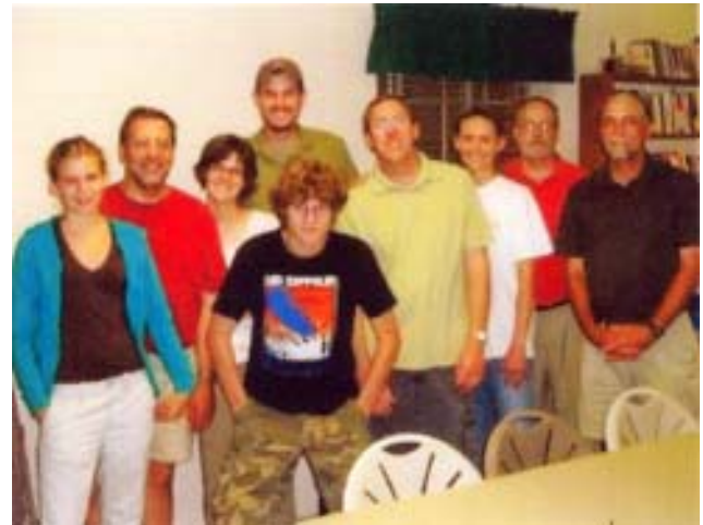
Last year’s Pass Christian, MI VIM team

Help us make this trip a three-peat for Metropolitan. Volunteers on the first two trips not only made a real contribution to the health of the Gulf Coast—they also had a great time. We made friends down south, but we also developed a deep sense of community with our fellow Metropolitan volunteers. We would love to have you join us in 2008.